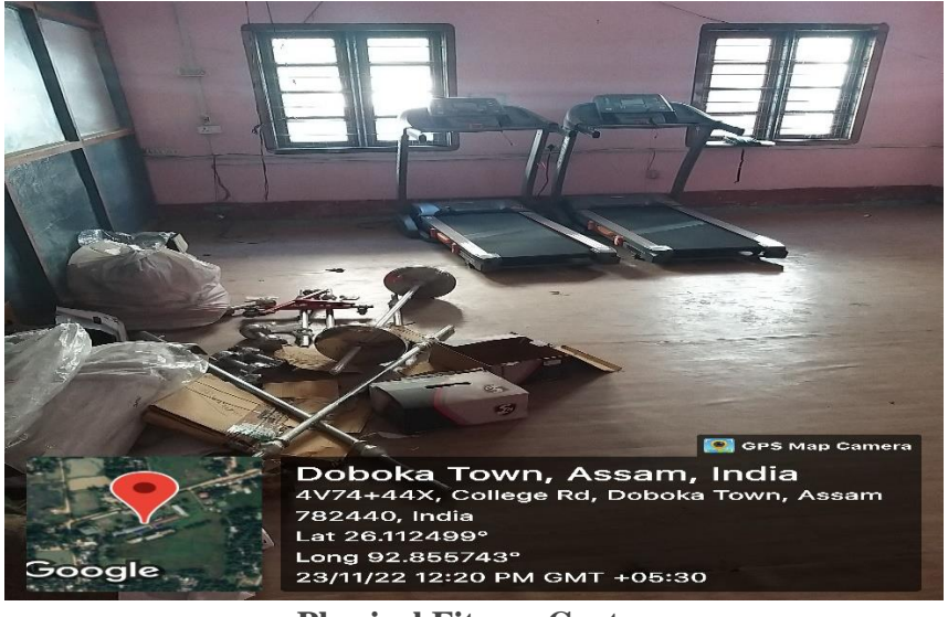
Physical Fitness Centre